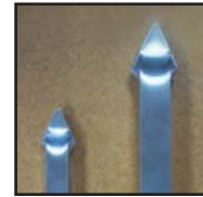
Punched Picket Spear