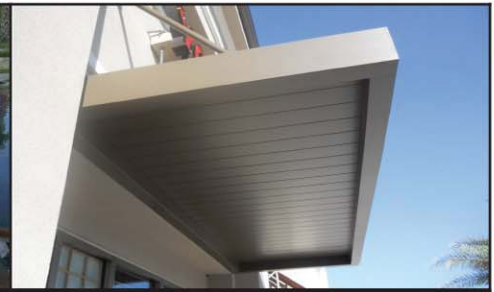
Canopies & Walkways