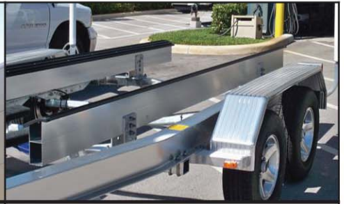
Boat Trailers & Lifts