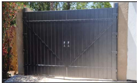
Fence, Wall, Gates & Enclosures