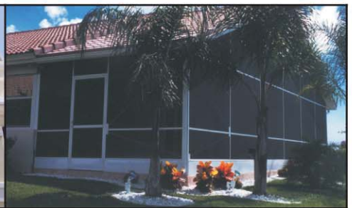
Patio Screen Rooms

To stay up-to-date with all of our product lines please view our online catalog at: www.easternmetal.com