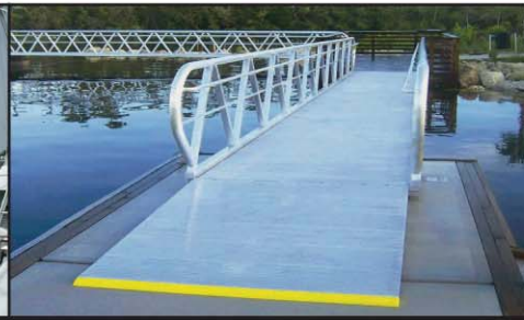
Dock, Ramp & Gangway