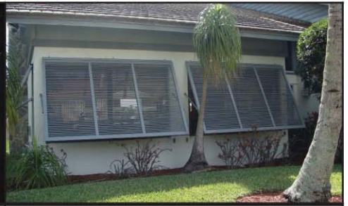
Bahama & Colonial Shutters