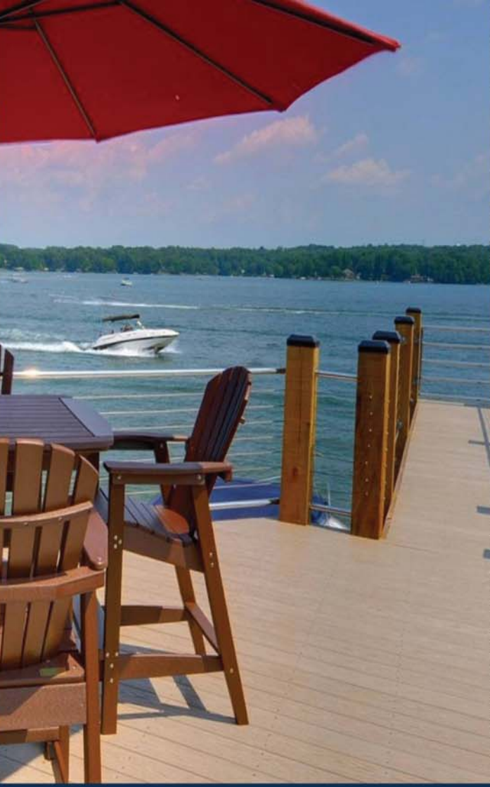
Endeck Capped Cellular PVC Decking