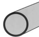
Bright Dipped Drawn Tube