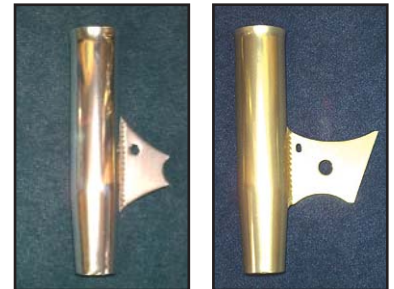
10" Swedged Old Style with Welded Pins left: T-Top Wedge right: Long Wedge