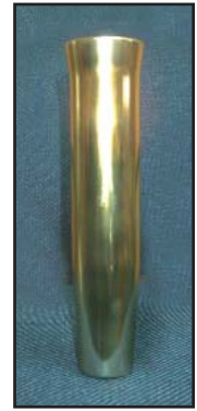
10" Swedged New Style w/ Welded Pins, No Blade