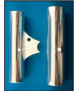
8.5 degree Straight top: w/ T-Top Wedge bottom: w/o wedge