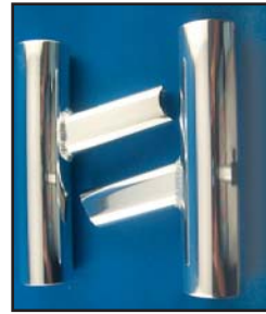
15 degree Weld On